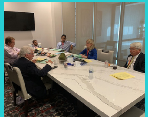
Physicians discuss resolutions at the First District Caucus.